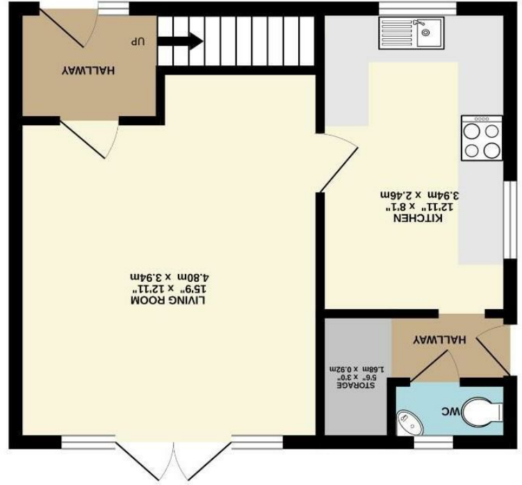
GROUND FLOOR 386 sq.ft. (35.8 sq.m.) approx.